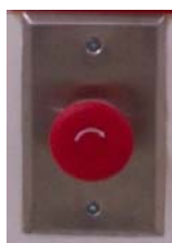
Emergency Shut Off